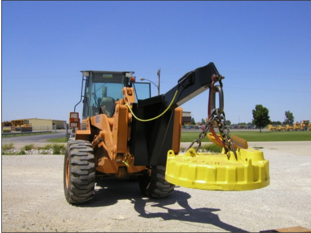
The PWCE JIB MAGNET is a 8 foot jib with a large 36" magnet attached.